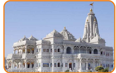
Prem Mandir (Mathura)