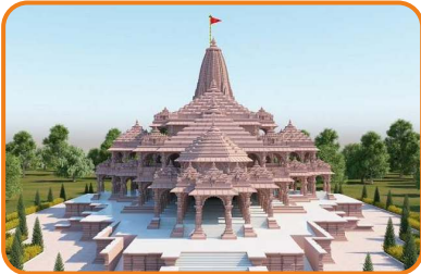
Ram Mandir (Ayodhya)

Discover the Historic City of Agra and its in & around Exciting Attractions. For more details, visit our website at: www.isocon2024.com