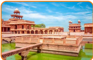
Panch Mahal (Fatehpur Sikri)