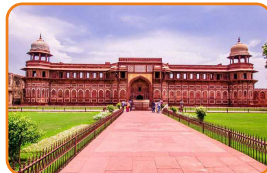
Agra Fort (Agra)